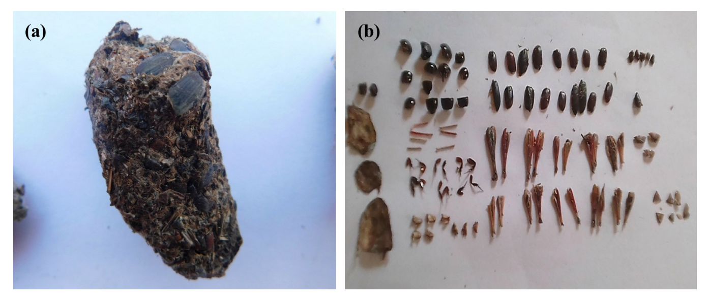
Figure 3. (a) A complete pellet, and (b) example of fragments of prey remains contained in a pellet of the Malagasy Pond Heron at Sofia Lake, northern Madagascar.

tive importance of Coleoptera (44.9%), Orthoptera (14.4%), Odonata (10.3%) and Hemiptera (4.9%). A large variety of insect families was also recorded (see Appendix 1). Tenebrionidae (Coleoptera) and Hydrophilidae (Coleoptera), represented 13.5% and 11.1% of the total prey items, respectively, were the main invertebrate groups. These families were followed by Acrididae (Orthoptera, 9.4%), Libellulidae (Odonata, 8.4%), Dytiscidae (Coleoptera, 6.9%) and Naucoridae (Hemiptera, 4.9%) (see also Appendix 1). Three species of fish (Cyprinus carpio, Channa sp. and Tilapia sp.) and two species of frogs (Boophis sp. and Rana sp.) were identified in the diet of the Malagasy Pond Heron. The number and percentage of each identified prey item are given in Appendix 1.