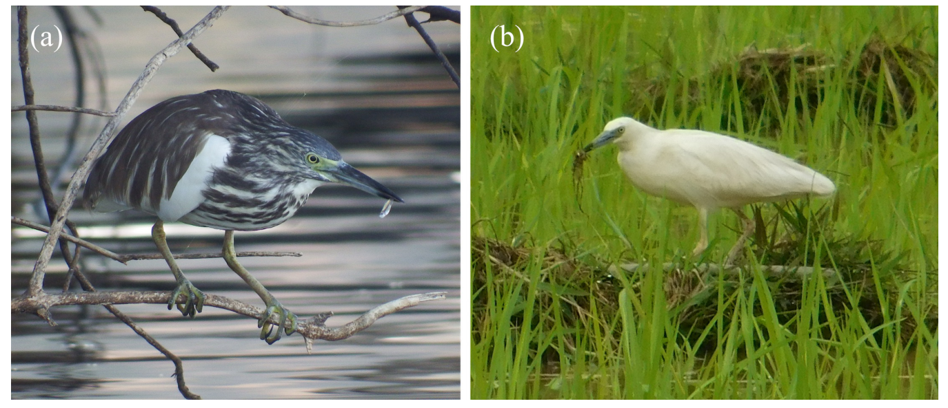
Figure 5. (a) Juvenile Malagasy Pond Heron capturing a small fish, and (b) an adult capturing an invertebrate at Sofia Lake.

This study is the first in Madagascar to analyze in detail the diet of the Malagasy Pond Heron, based on regurgitated pellets and direct observation. However, it has already been anecdotally documented that the Malagasy Pond Heron feeds on fish, frogs, skinks, geckos and insects (Langrand 1995, Morris and Hawkins 1998, Kushlan and Hancock 2005). Our findings did not deviate from those reported, but they show more precisely the different types of prey consumed by this species. Our findings combined with those of previous reports affirm that the Malagasy Pond Heron is a diet generalist feeding on a wide range of invertebrate and vertebrate prey. This diversity of prey